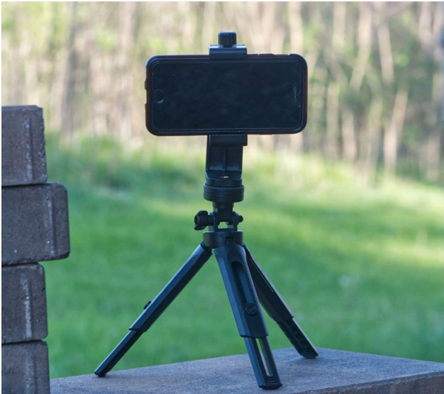
A small tripod for a smartphone. They are relatively inexpensive – the author found this at a local dollar store!