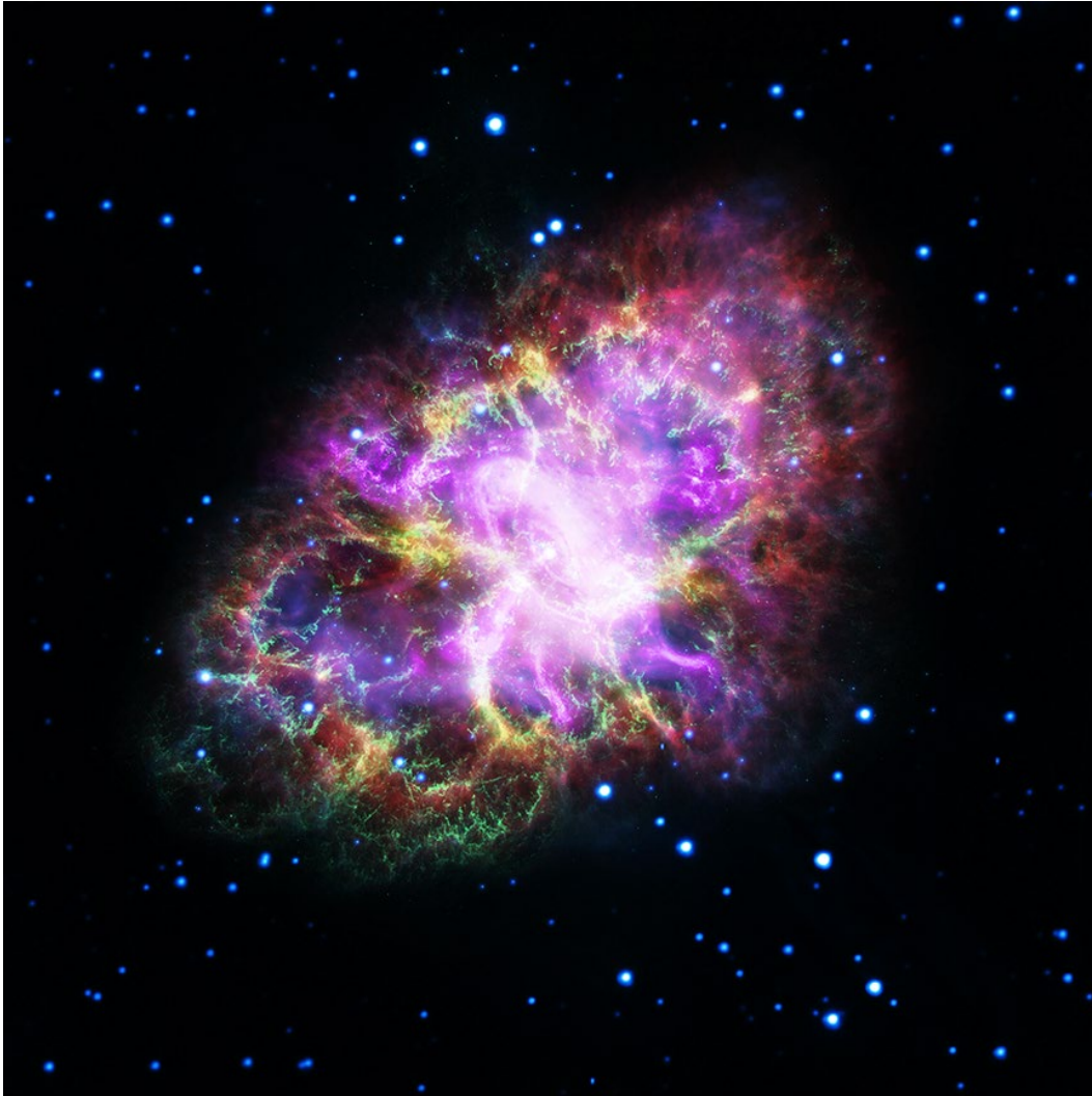
The Crab Nebula, located in the Taurus constellation, is the result of a bright supernova explosion in the year 1054, 6,500 light-years from Earth. Credit: X-ray: NASA/CXC/SAO; Optical: NASA/STScI; Infrared: NASA/JPL/Caltech; Radio: NSF/NRAO/VLA; Ultraviolet: ESA/XMM-Newton