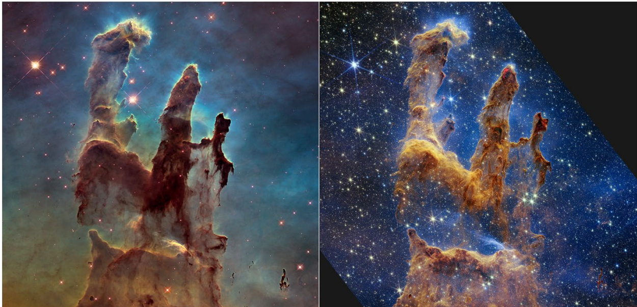
NASA's Hubble Telescope captured the Pillars of Creation in 1995 and revisited them in 2014 with a sharper view. Webb's infrared image reveals more stars by penetrating dust. Hubble highlights thick dust layers, while Webb shows hydrogen atoms and emerging stars. You can find this and other parts of the Eagle Nebula in the Serpens constellation.