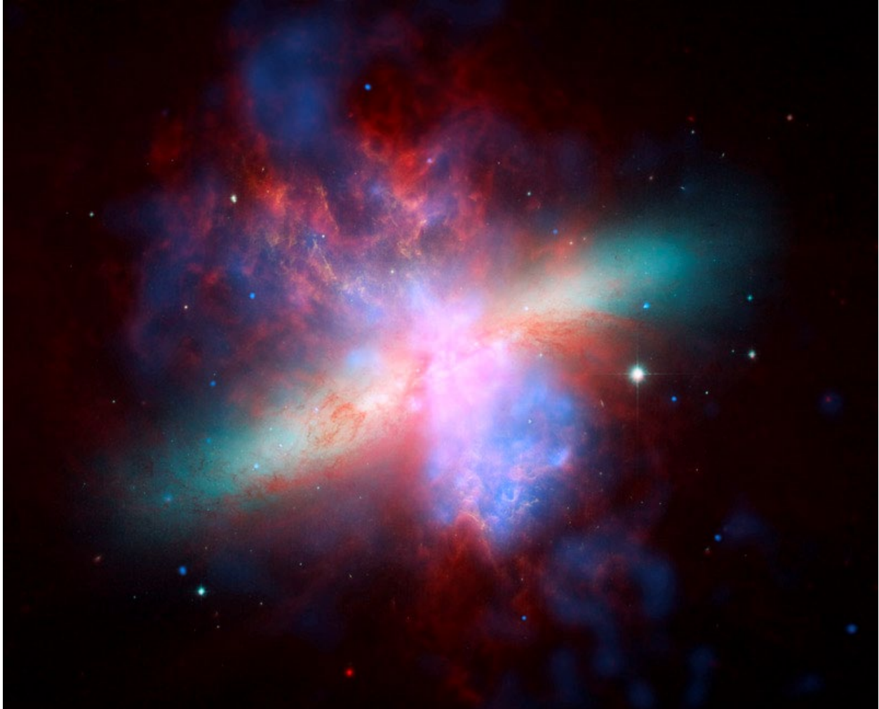
The Cigar Galaxy.

When searching for this object, look towards the ‘belly’ of Draco with a medium-sized telescope.