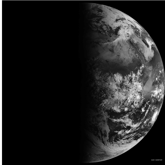
Caption: Earth from orbit on the March equinox, as viewed by EUMETSAT. Notice how the terminator – the line between day and night - touches both the north and south poles. Additional information can be found at http://bit.ly/earthequinox